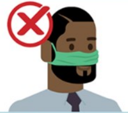
Only on your nose