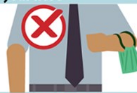
On your arm