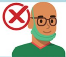
On your chin