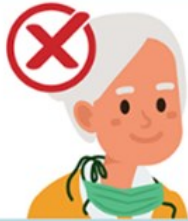
Around your neck