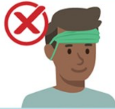
On your forehead