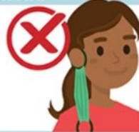
Dangling from one ear