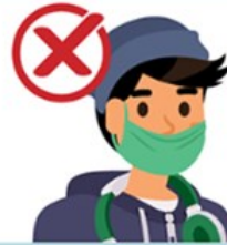
Under your nose